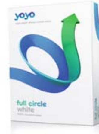
yoyo full circle